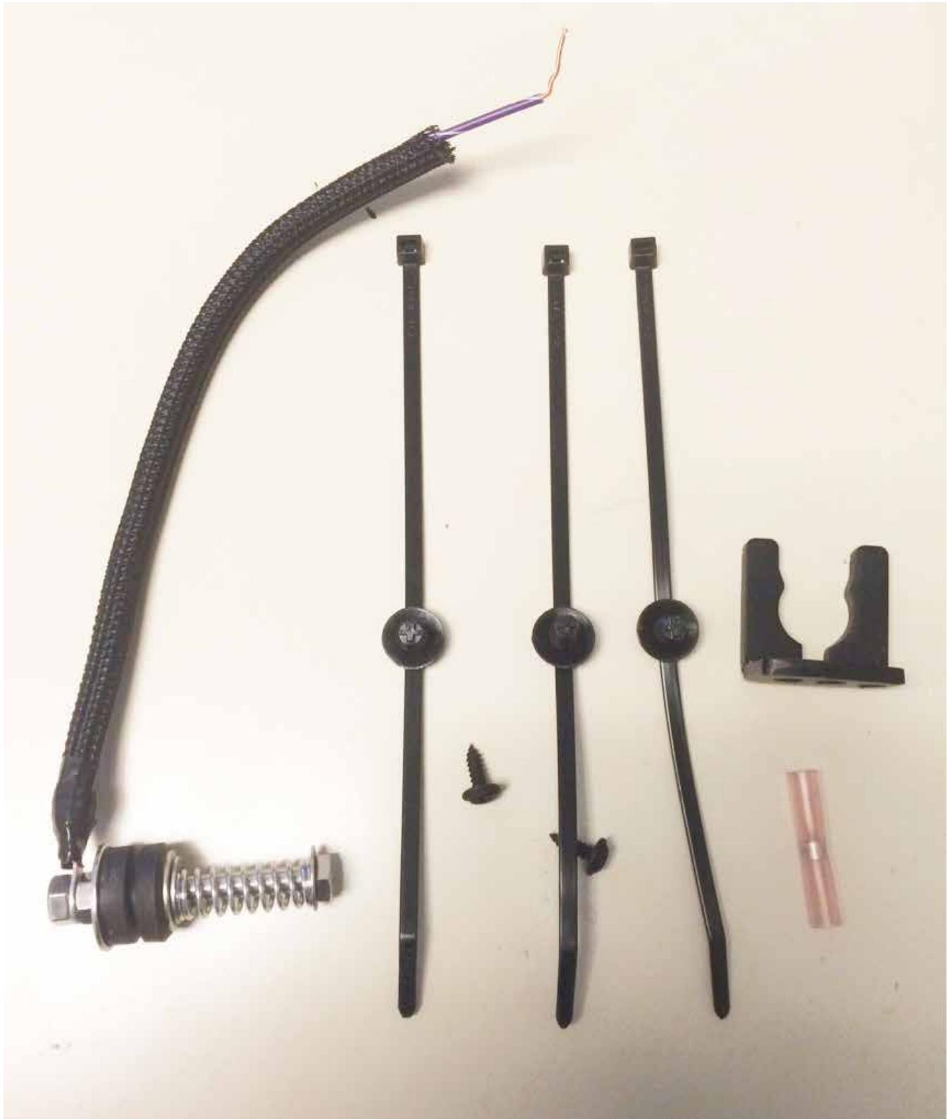
Upgraded "Tilt" Switch Components