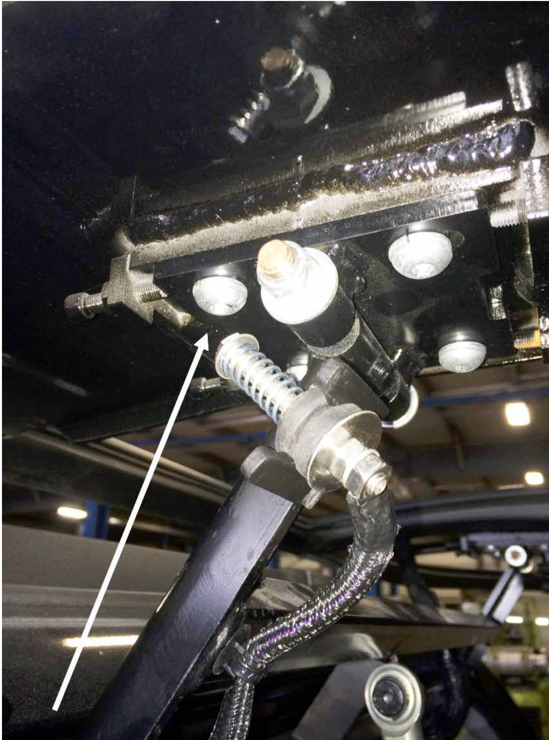
Switch mounting location.

Switch must contact hinge mount bolt as shown when closed.