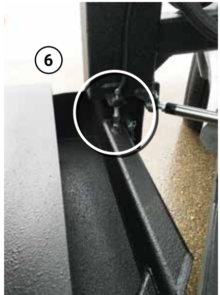
Lift Pan "UP" Limit Switch *Down limit is bottom of hydraulic stroke