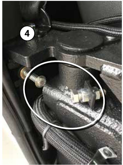
Lift Pan "OUT" Limit Switch