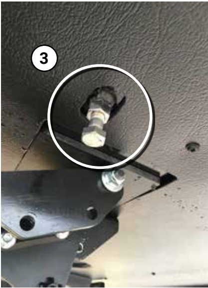
Door "IN" Limit Switch Contact