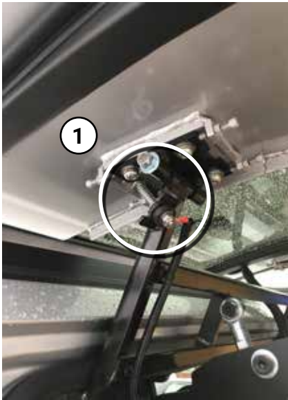
Door Tilt Switch