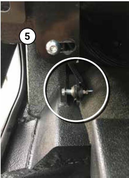
Lift Pan "IN" Limit Switch